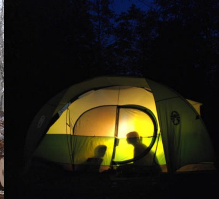
Revenue-generating activities on Minnesota's School Trust Lands