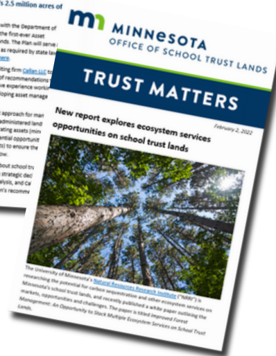
Electronic newsletters and news releases